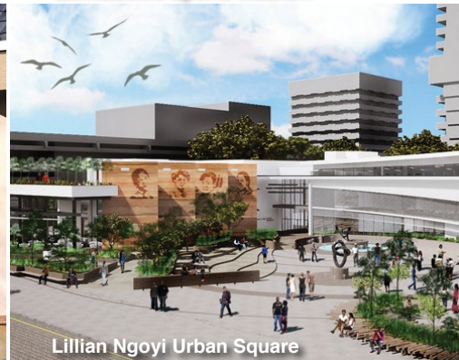
Lillian Ngoyi Urban Square