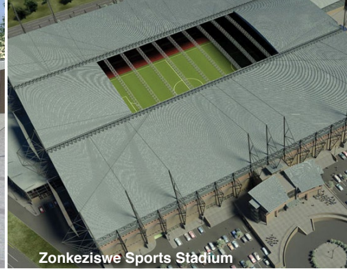
Zonkeziwe Sports Stadium