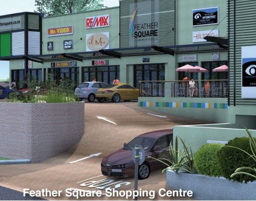
Feather Square Shopping Centre