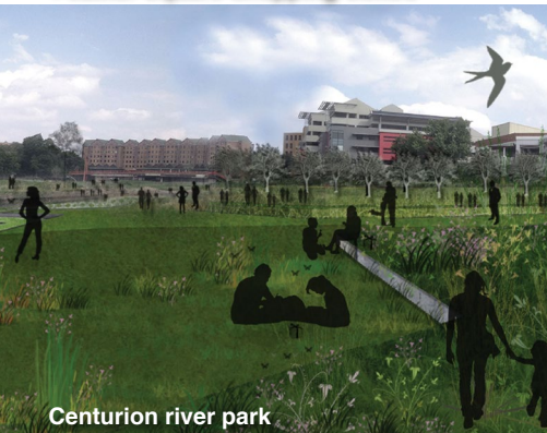
Centurion river park