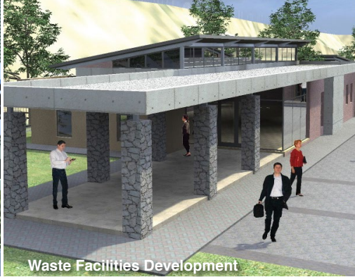
Waste Facilities Development